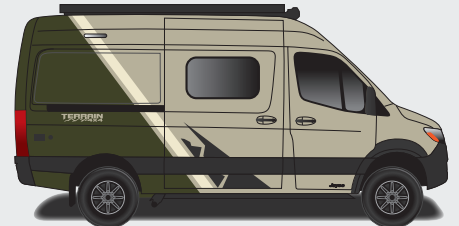
Forest Glade Partial Paint (Sandstone Van Only)