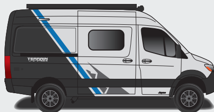
Aztec Partial Paint (Silver Van Only)